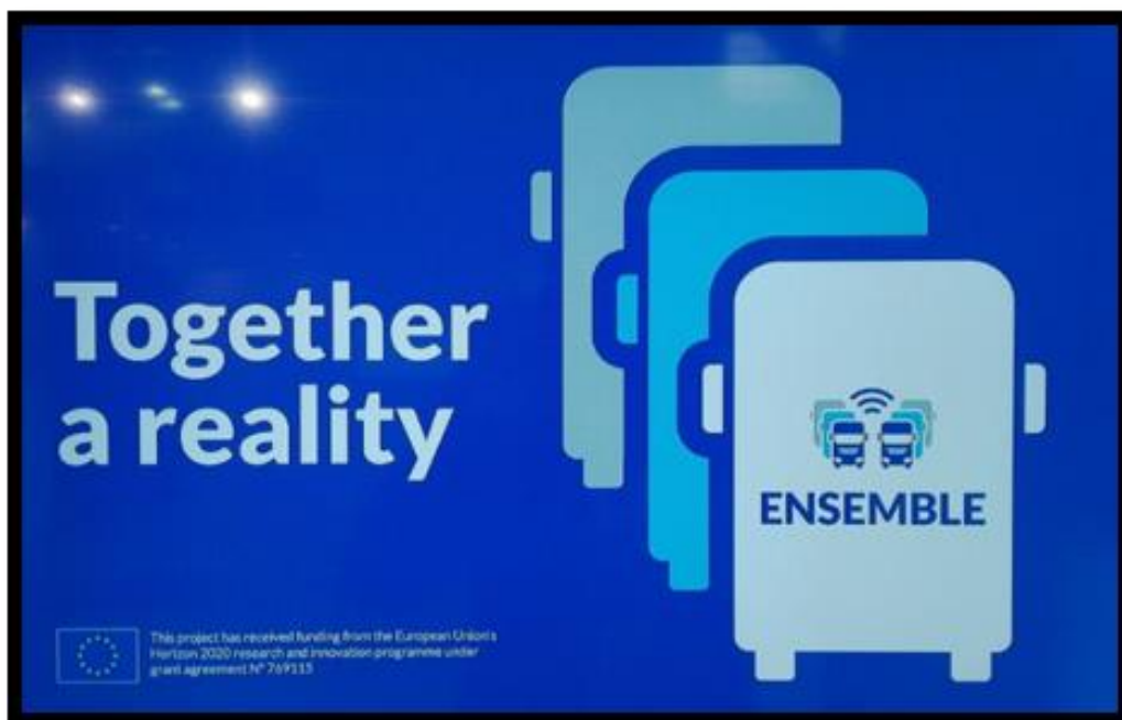
Figure 1: ENSEMBLE digital poster

The digital poster (see Figure 1 below) has been produced at the occasion of the ITS World Congress in Copenhagen (17-21 September 2018), and showcased at the ERTICO's exhibition booth where ENSEMBLE had a fixed presence. For the same conference, a flyer was produced (see Figure 2 below), with information about the project and the consortium.