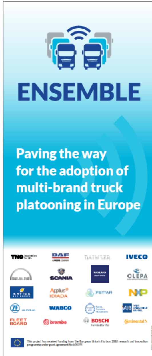
Figure 3: ENSEMBLE roll-up banner